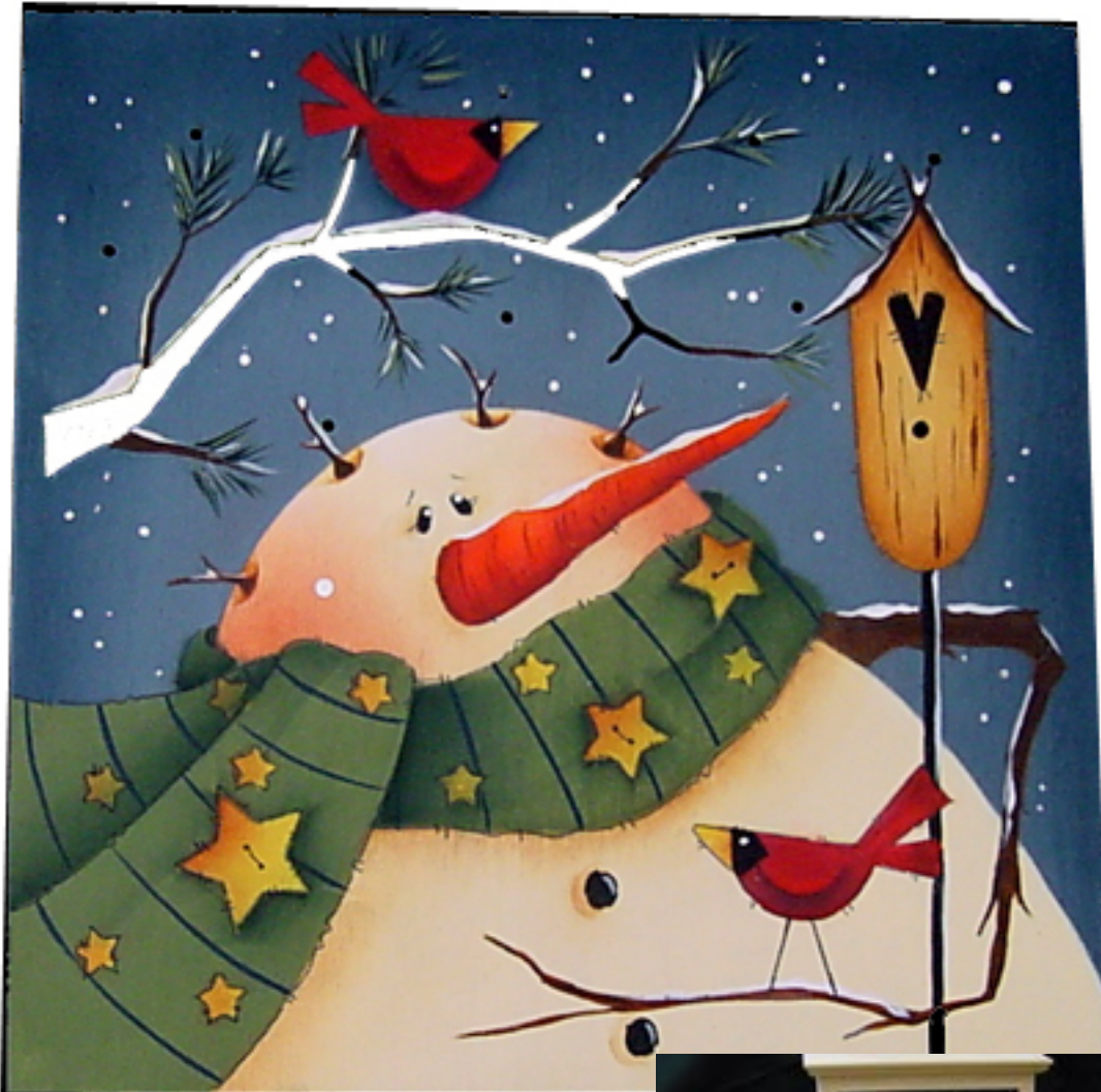
Table Top Night Light

This new night light is truly unique in its use of interchangeable insert panels. The night light set includes the table top "box", 4 changeable inserts, plug in electrical with on/off switch in the cord.