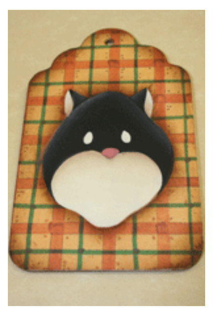
Side-load float the shading/highlighting on the face & background.