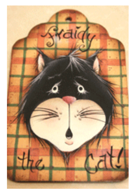
Cheeks, whiskers, mouth and lettering...