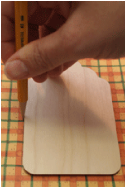
Select background paper, or paint with colors of your choice.