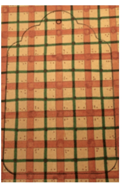
If using paper, carefully trace around tag for a pattern. Cut along lines with sharp scissors..