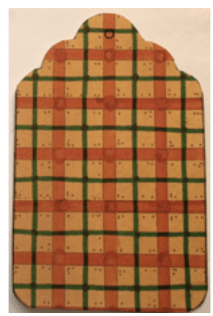
Apply sealer to wood, add the paper cutout and then brush more sealer on, let dry.