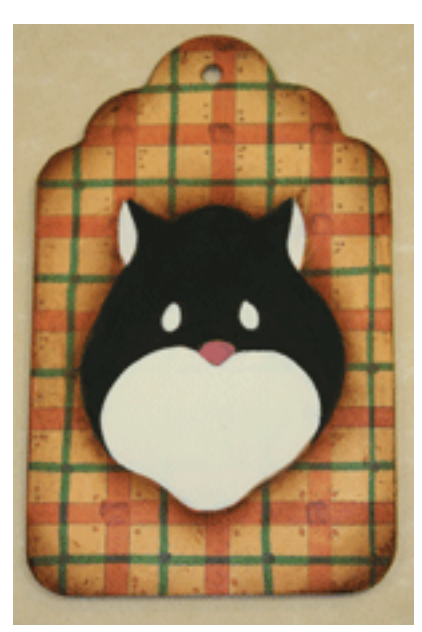
Poke hole for hanger. Transfer the pattern and then basecoat the cat's face.