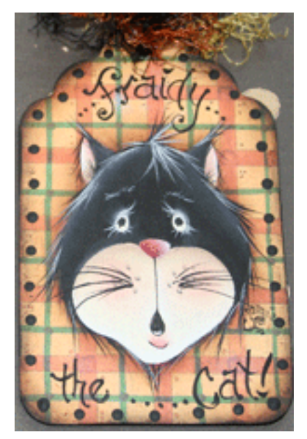
Add dots and darken shading on edges. Add eyelash braided neck hanger.