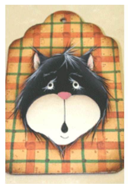
Add hair and facial details...