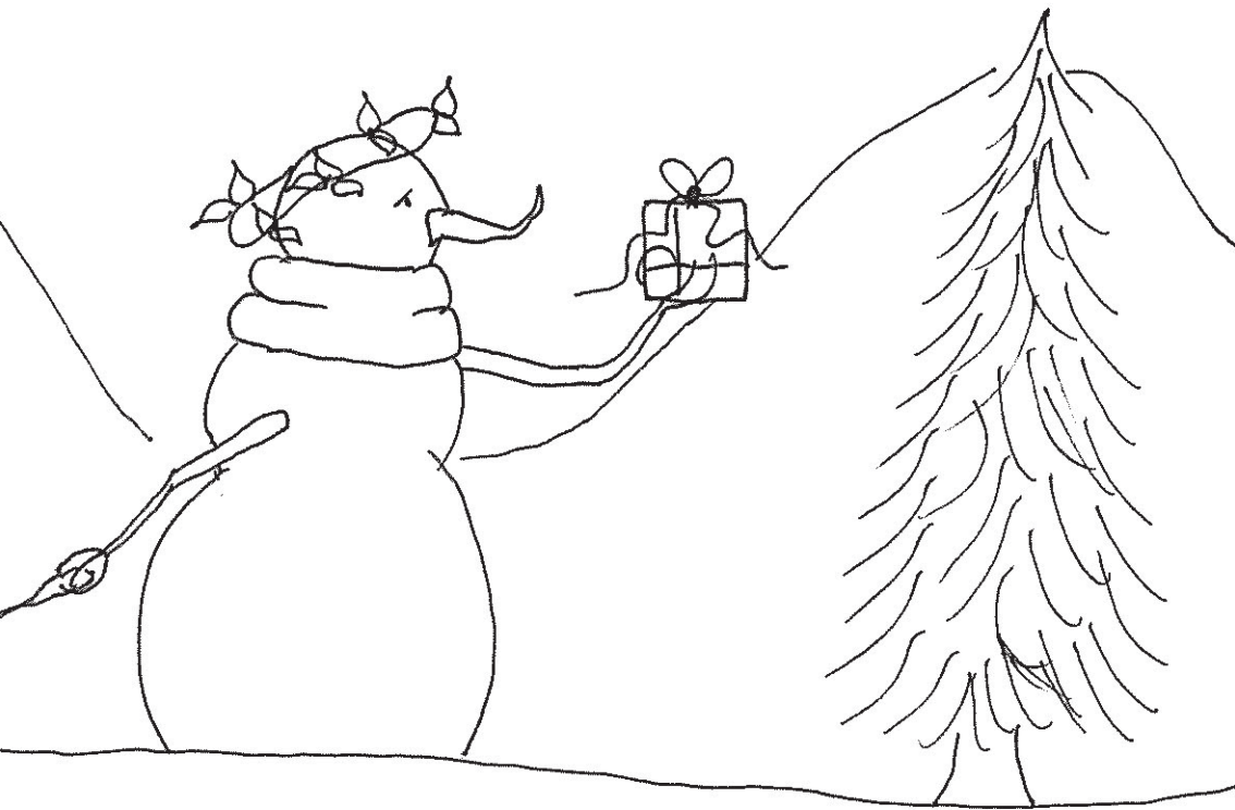
hinde samuels 2019