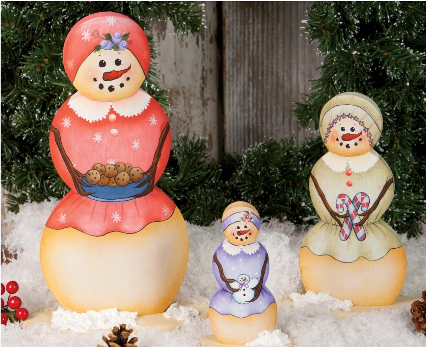
Spice Pink – large gal’s dress & hat (snowflakes are Warm White.)