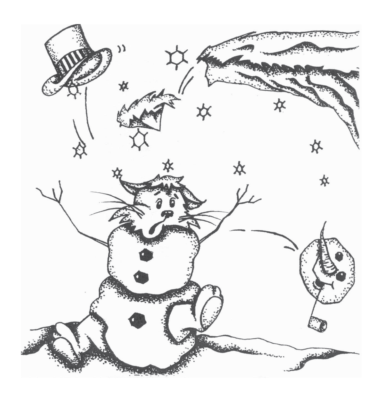
No. 331304 Page 6 © Artist's Club ®. All rights reserved. For private, non-commercial use only. Please see our web site for terms of use. Designed by Joyce Erickson for Artist's Club®.